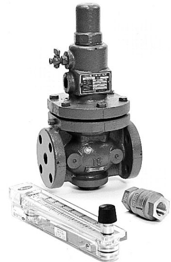
Posi-Pressure Control System Kit, consisting of controller, check valve, airflow meter