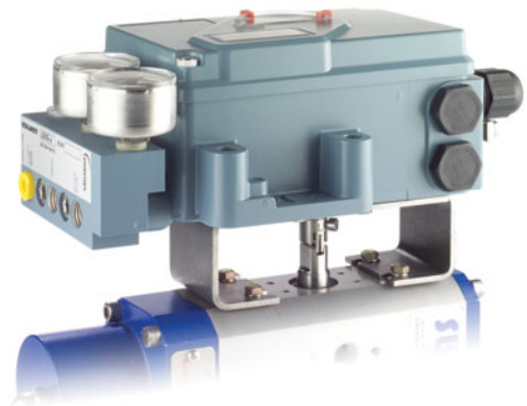
Example for mounting on rotary actuators.